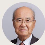
Dr Koichiro Matsuura

Chairman, Judging Committee, Yidan Prize